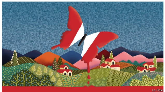
Butterfly reflecting the colors of the Peruvian flag. The blood of the victims of terrorism fertilizes the earth and peace processes.

4. Right Relationship: Social relationships encompass both hierarchical and horizontal experiences. In right relationship, all of these are directed toward mutuality and the common good. The social fabric of a broken society can only be restored on a foundation of respect and affirmation of the inherent worth and dignity of each person. Right relationship calls for humility to understand more deeply our interconnectedness and the mutual benefit to all of truly just relationships.