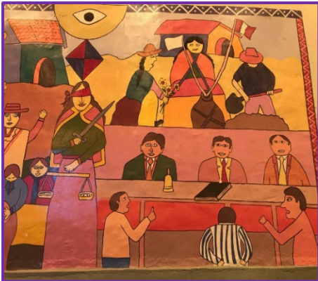
From the mural in the church of San Juan de Jarpa.

SEE: In 2001 the Truth and Reconciliation Commission , responding to a just cause , was formed in Peru. During 20 years of armed conflict over 69,000 Peruvians were killed; many more endured unspeakable violence.