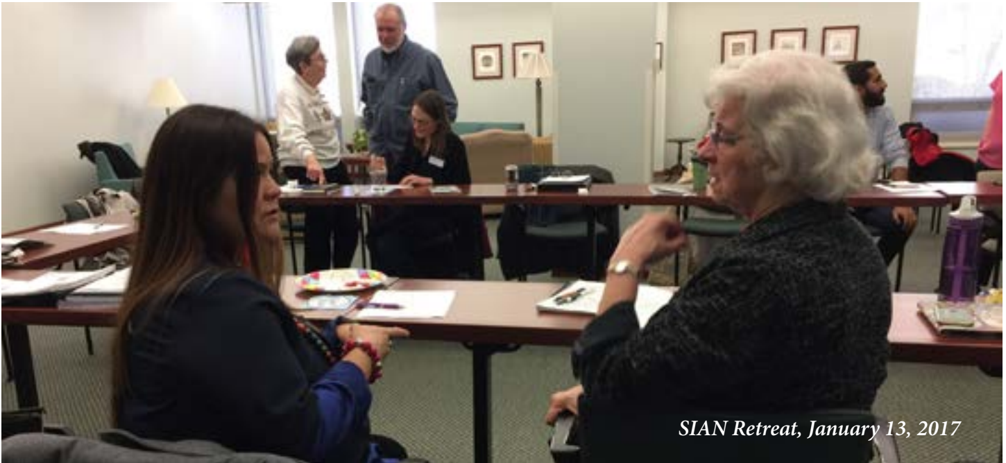
SIAN Retreat, January 13, 2017