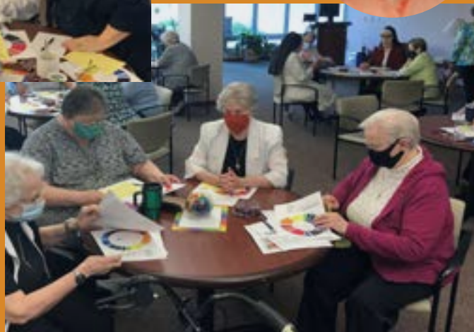
Masked Sisters during General Assembly 2020