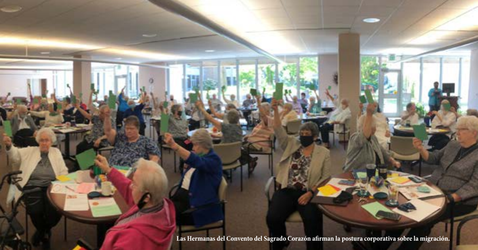
Las Hermanas del Convento del Sagrado Corazón afirman la postura corporativa sobre la migración.