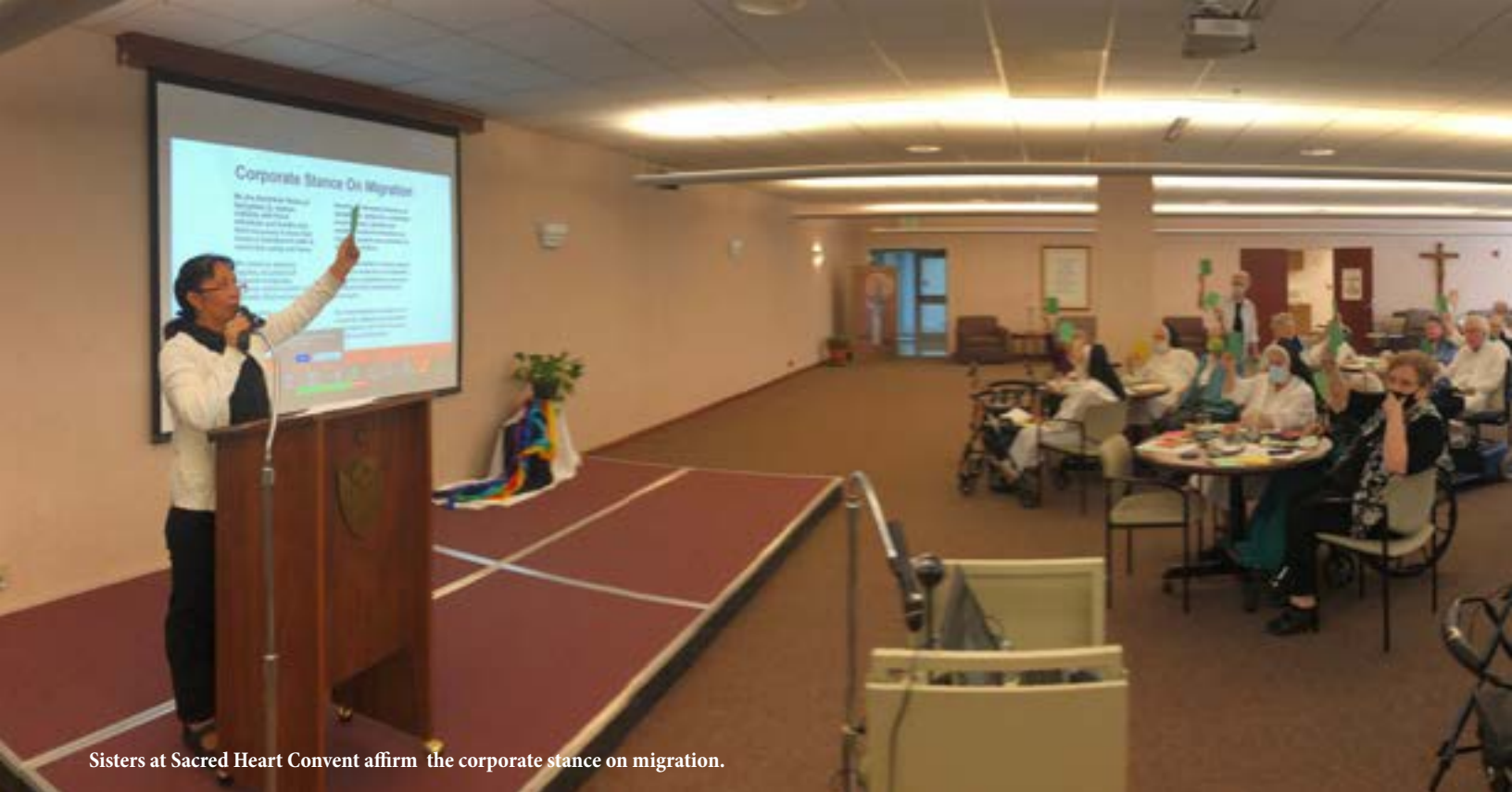
Sisters at Sacred Heart Convent affirm the corporate stance on migration.