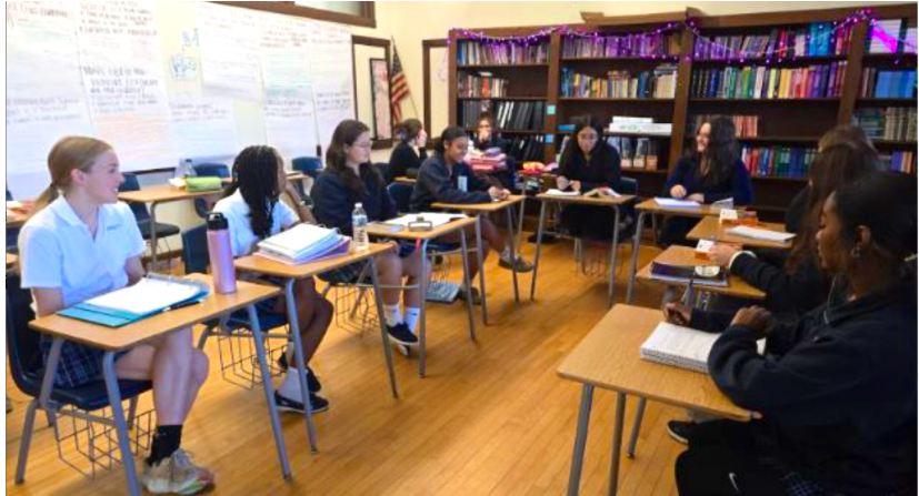
Students of Trinity High School, River Forest, Ill. face each other to engage ideas in their English class. This format supports discourse. One student shared, "I like hearing other people's ideas and questions— it helps me develop my understanding even more!"