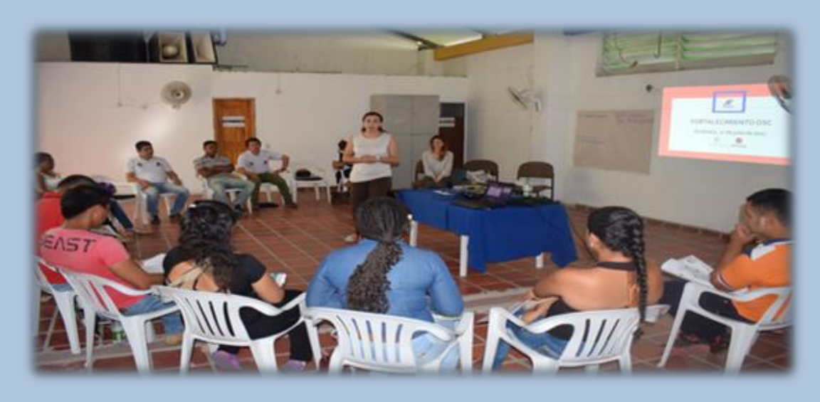
Community workshop organized by the Dioceses of Tibú (El Tarra, Catatumbo)

The conflict has brought many needs to people who have been victims, there are still victims in the municipality, many people have lost their families and everything they had, single mothers, people